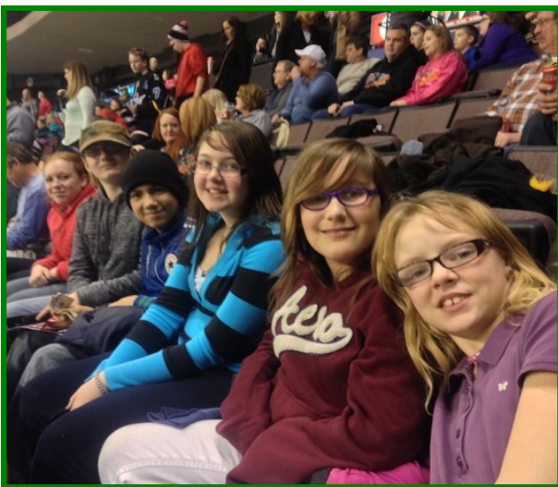
Erlanger youth had a great time at the Cyclones Game!