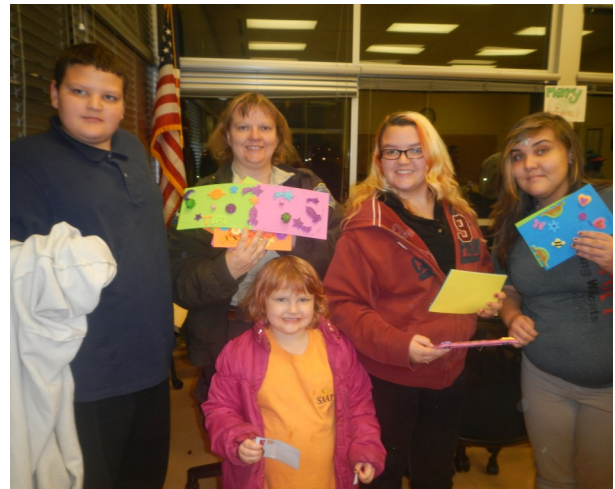
Turner Construction sponsored the 2nd Annual Holiday Party for YLD, and it was bigger than last year. Teens and their families from Newport, Dayton, Campbell County, and Erlanger enjoyed a fun evening of pizza, holiday crafts, and quality time together.