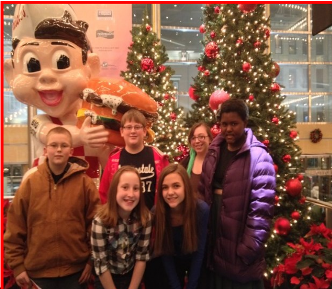
Youth from CCMS and DAYTON enjoyed a wonderful evening at the Ballet thanks to MVK and their hard work in YLD!

YLD Youth have some Holiday FUN. From Parties to the Ballet, YLD Youth and Teens are able to experience lots of fun adventures.