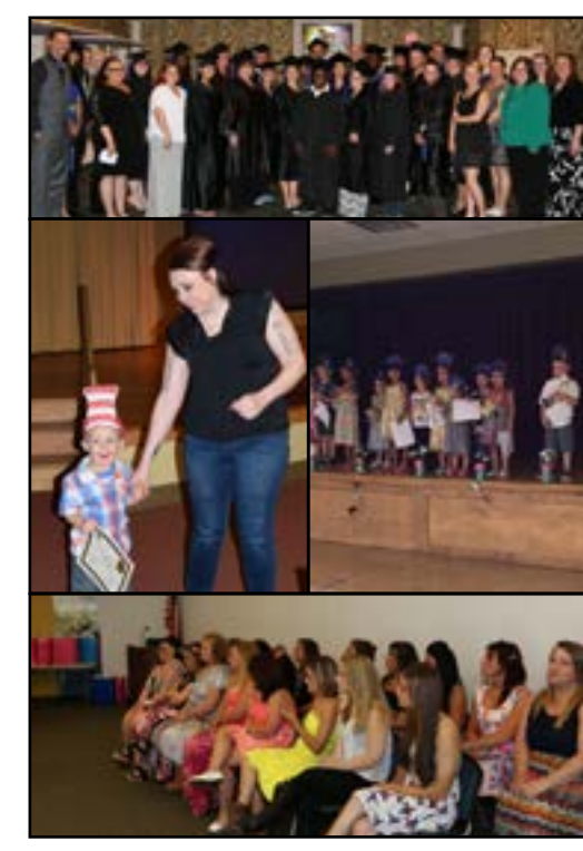
CONGRATULATIONS TO ALL OF OUR SPRING 2015 GRADS!