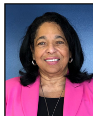
Wanda Walker-Smith African American Chamber