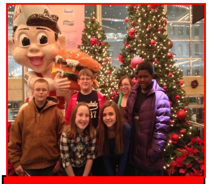
Youth from CCMS and DAYTON enjoyed a wonderful evening at the Ballet thanks to MVK and their hard work in YLD!