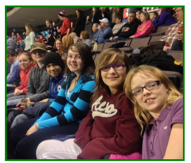
"The Cyclones games was so fun! I had never been to a game before, I hope I can come again" Erlanger , YLD

Turner Construction sponsored the 2nd Annual Holiday Party for YLD, and it was bigger than last year. Teens and their families from Newport, Dayton, Campbell County, and Erlanger enjoyed a fun evening of pizza, holiday crafts, and quality time together.