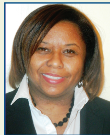
Maida Session Duke Energy