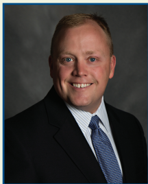
Jason Reed Edmondson & Associates